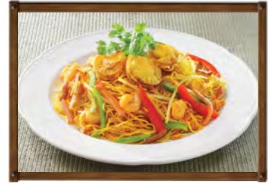
星洲帆立貝炒米粉 Singaporean Fried Vermicelli with Scallops (Hong Kong Style)