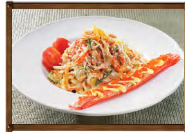
雞肉蟹柳柚子胡麻冷麵 Chilled Noodles with Chicken and Crab Meat Stick in Yuzu Sesame

以上即炒麵飯及冷麵每款$150，凡惠顧2至4客，即送冰凍蜜桃茶一勾 above "Made to Order Noodles and Rice" price at $150 each compliment a pitcher of Iced Peach Tea upon 2 to 4 orders