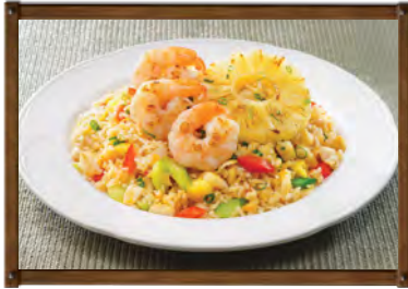
大蝦菠蘿海鮮炒飯 Prawn and Pineapple Seafood Fried Rice