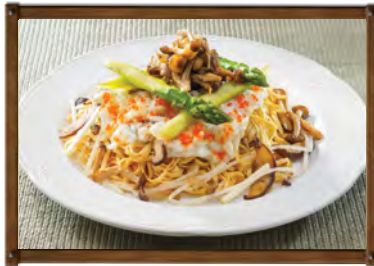
蟹肉靈芝菇蘆筍炆伊麵 Braised E-Fu Noodles with Crab Meat, Marmoreal Mushroom and Asparagus