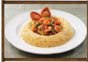
鮑魚福建炒飯 Abalone Hokkien Fried Rice (Hong Kong Style)