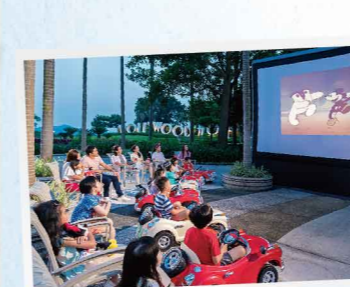
Disney Movie Premiere