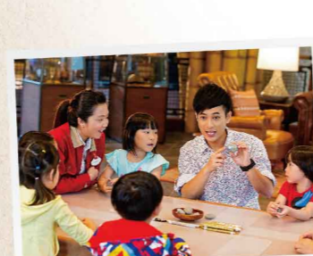
Arts and Crafts Workshop