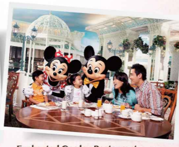
Enchanted Garden Restaurant