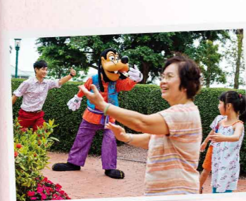
Tai Chi with Master Goofy